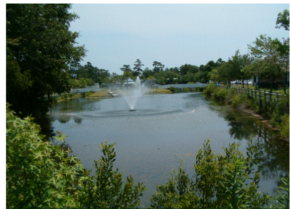
Figures 1 and 2: Stormwater ponds used for irrigation in Myrtle Beach, and recreation/aesthetics in Charleston, SC.

The research summarized in this report found that some ponds protect receiving waters from pollution and protect communities from flooding during storms, while other studies found that ponds were polluted, can impact receiving waters, and are not controlling stormwater runoff as they were designed and permitted. Because stormwater ponds have diverse designs and characteristics, determining a common denominator for pond performance is difficult. These structural designs (Appendix A) and other factors such as age, location within the watershed, and linkages with other ponds play an important, albeit not well understood, role in their functioning and performance. A variety of research on stormwater ponds addresses their functionality, water and sediment quality, and surface and groundwater impacts. If not properly maintained, ponds can accumulate sediment and debris and have slope and/or outlet failures, resulting in high sediment and pollutant loadings to receiving waters. When sediment is removed from ponds as part of routine maintenance, contaminated sediments could require disposal at certified landfills.